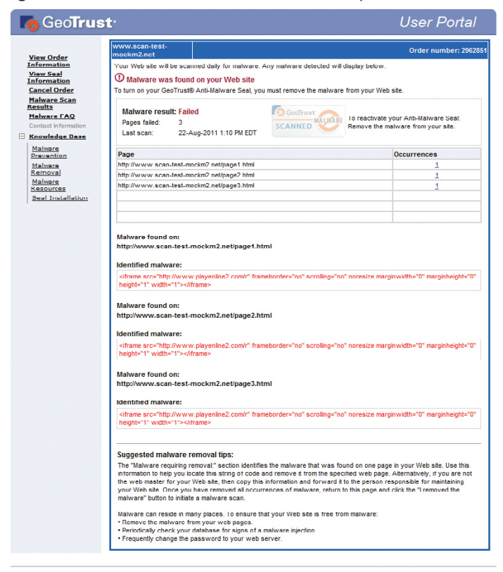
Figure 5. GeoTrust Website Anti-Malware Scan Report

@2011 GeoTrust, Inc. All rights reserved.